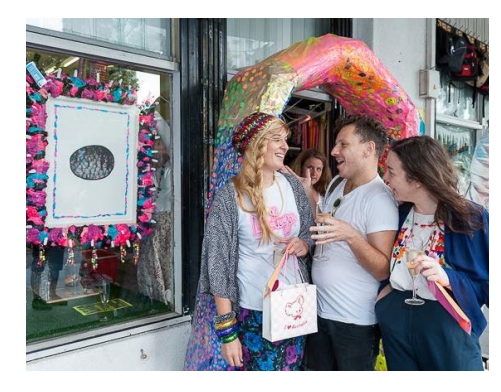
runway : 1. launch #25 2. launch #24 3. launch of artist commissions.