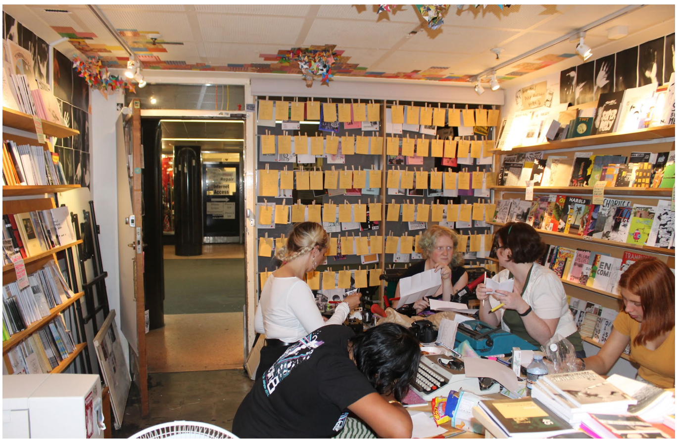
Sticky Institute Melbourne