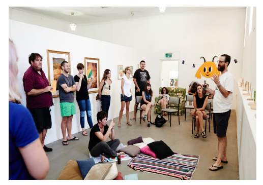
Paper Mountain Perth