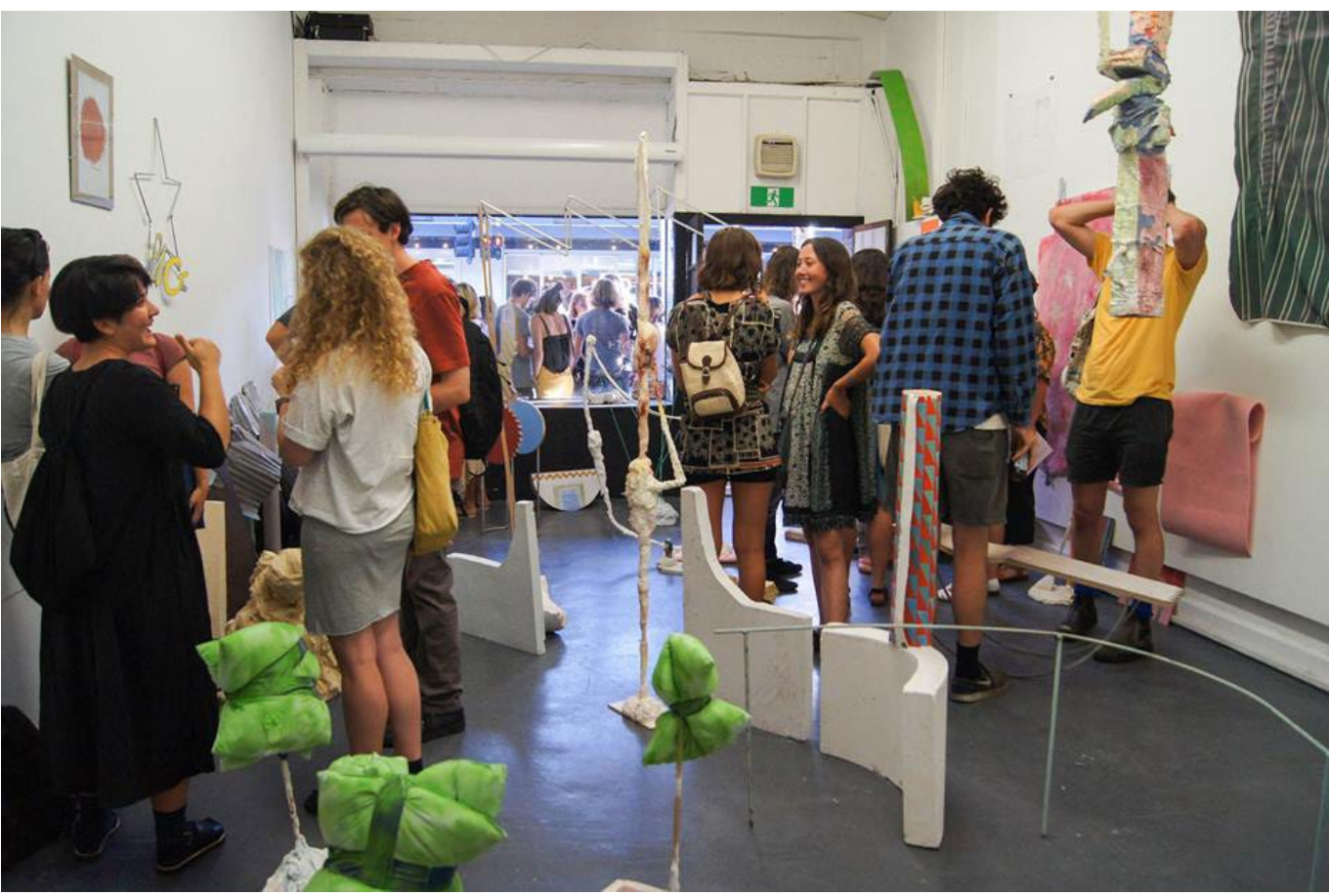
Seventh Gallery Melbourne