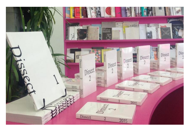
Dissect Journal launch at the IMA, Brisbane, 2015.