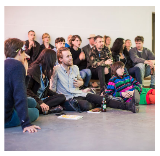
un Magazine Melbourne 1. un Retrospective, in Melbourne Now, NGV, 2014.