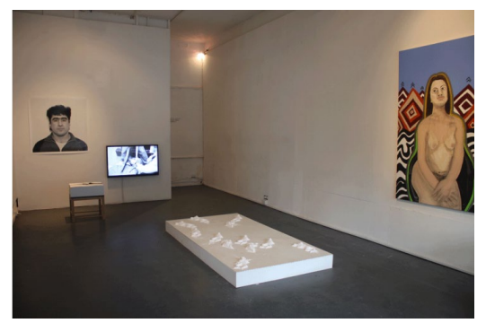
Seventh Gallery Melbourne